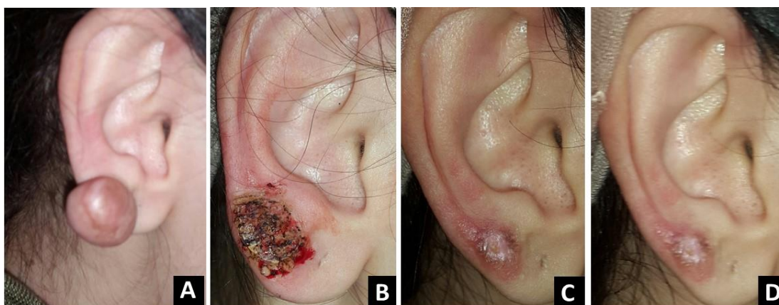
Figure 2: A 27-year-old woman with auricular keloid at first visit (A), during the time of debulking and the intralesional injection of steroid and methotrexate (B), after one month follow-up and repeating injection (C), the same patient after six months of follow-up (D).

Keloid scars are benign, but physically and cosmetically disturbing for patients, and challenging for doctors to treat. Moreover, they can impact patients' quality of life. There are numerous methods of treatment, ranging from non-surgical to surgical strategies, with different levels of response and recurrence rates. 15 Especially, in sessile-type keloids, highlights the need for modified therapy plans and